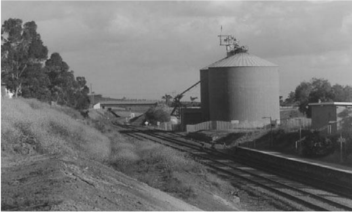
Grain Silos on the Main North Line at Aberdeen - 2007

While many rural towns are using their silo walls for large scale public art works, that not only reflect the local community but also promote the region, Aberdeen is to lose their silos.