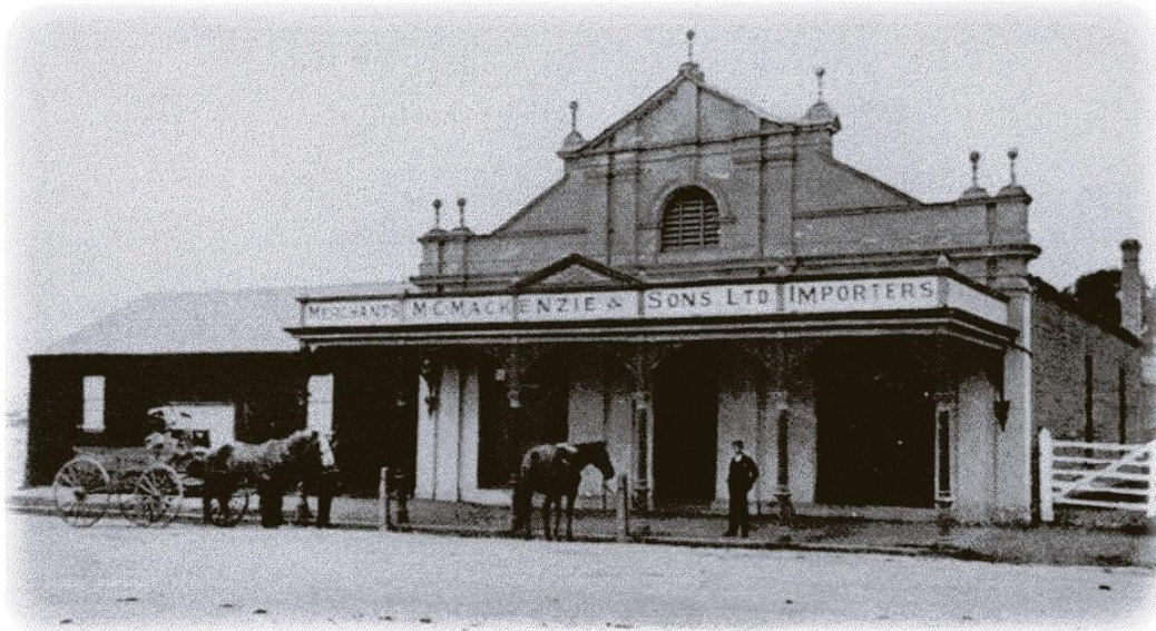
M.C. Mackenzie & Sons Ltd. Stores, Aberdeen - Post Card circa 1905