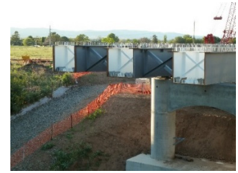
2nd October, 2013