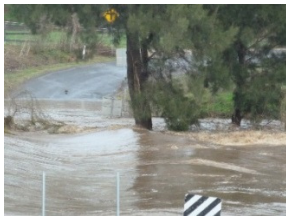
15th June, 2011