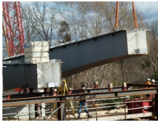
21st August, 2013