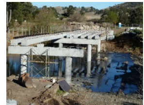
25th August, 2013