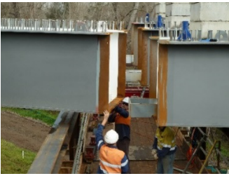
28th June, 2013