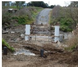
28th July, 2013